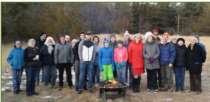
Hardy souls at the 2017 Winter Solstice Gathering at the Lyon Preserve in Pomfret – It was REALLY COLD!