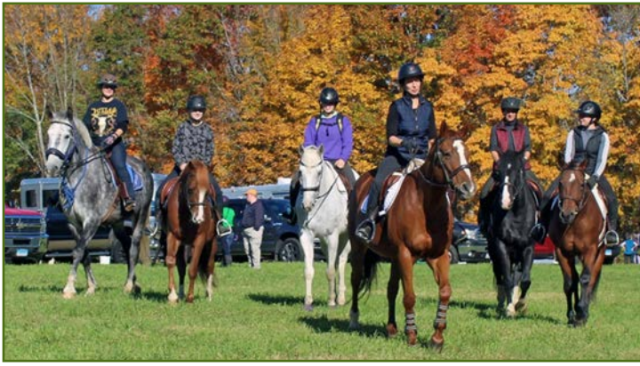
Nightingale Forest was a perfect setting for the PHTA fall trail ride