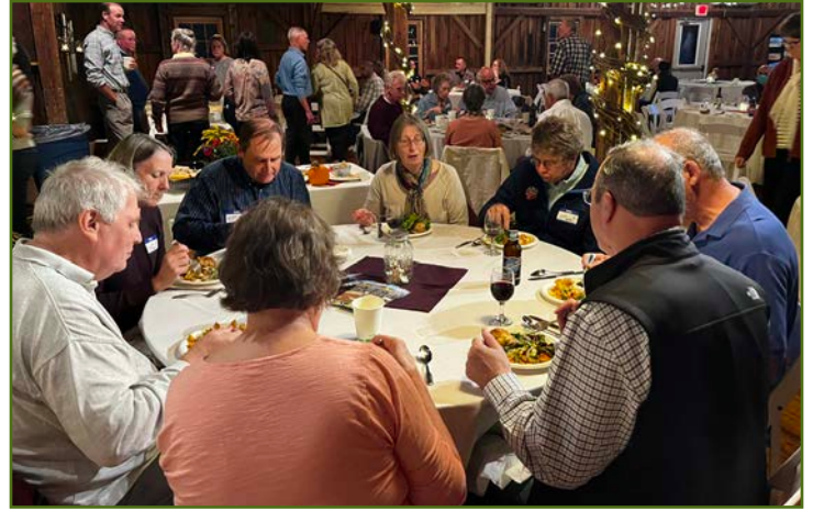
The Annual Meeting at Tyrone Farm