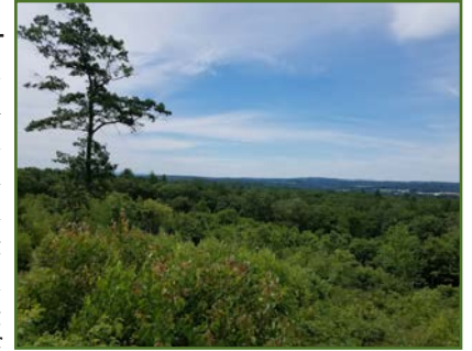
Bull Hill overlook.