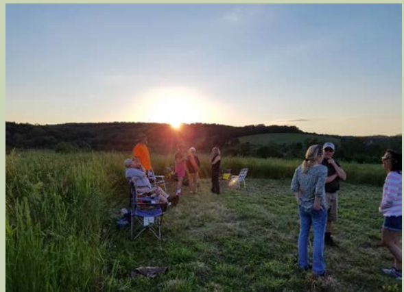
Land trust members watch the sunset at the 2023 Summer Solstice event.

The walk is part of the Connecticut Forest and Park Trails Day weekend, June 7-8. Enter Bull Hill Road from Senexet Road in Woodstock and park by the gate. For more information, see trailsday.org .