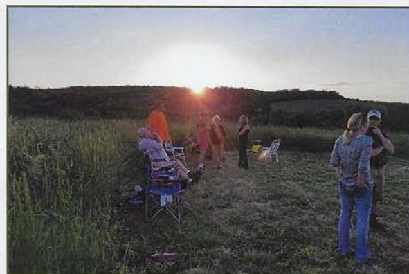
Land trust members watch the sunset at the 2023 Summer Solstice event.

The event runs from 7 pm to 9 pm. Parking is available along Holmes Road, between Modock Road and Wrights Crossing Road. If you'd like, you can bring your own chair and refreshments. We'll provide a firepit and fixings for s'mores.