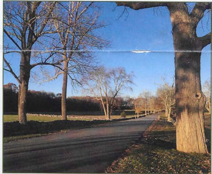
Above and Below Photo: Janet Booth's photographs capture the beauty of the Hillandale Woods that inspired Jimmie Booth 50 years ago.