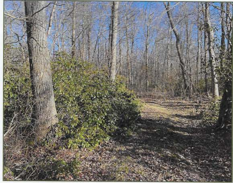
Above Photo: Existing trails on the property will be open to the public if it can be acquired by the land trust.

The gift from the Knowlton’s means that any donations you make to the Land Trust’s fundraising drive by mail or through the web site will be doubled, at least up to the $50,000 limit. To receive matching funds, donations must be received before September 30, 2024. You can help protect these remarkable woods.